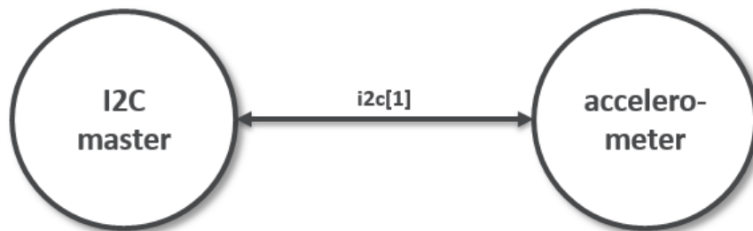
Figure 2: Task diagram of the accelerometer example

The following diagram shows the task and communication structure for this accelerometer example